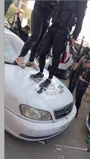
Terrorists takeover a Druze vehicle