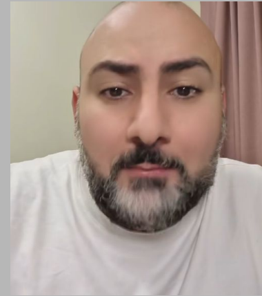
Announcement from Syrian Ministry of Interior that it was deep-faked